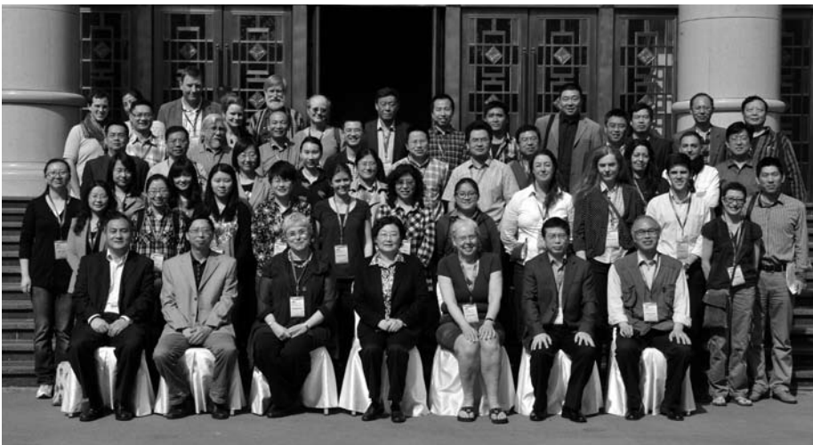
Participants of the 9th meeting of the Worked Bone Research Group in Zhengzhou City, China